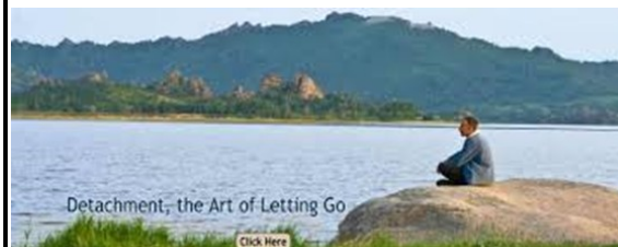
Detachment, the Art of Letting Go